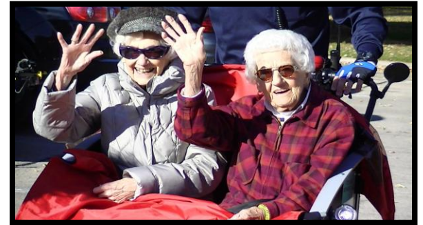
Lasata Senior Living Campus