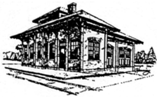
Interurban Depot • 1908