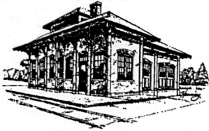
Interurban Depot • 1908