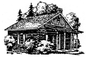
Trading Post Ozaukee County Pioneer Village

NEWSLETTER OF THE OZAUKEE COUNTY HISTORICAL SOCIETY